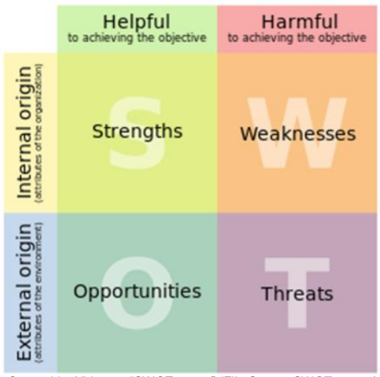
Created by Xhienne, "SWOT pt.svg" (File Source: SWOT_pt.svg)

Note that internal and external factors can be identified as either strengths or as weaknesses, depending upon their effect on the organization's objectives. In summary, a SWOT analysis is a valuable method of assessing current market conditions within the global cord blood banking marketplace.